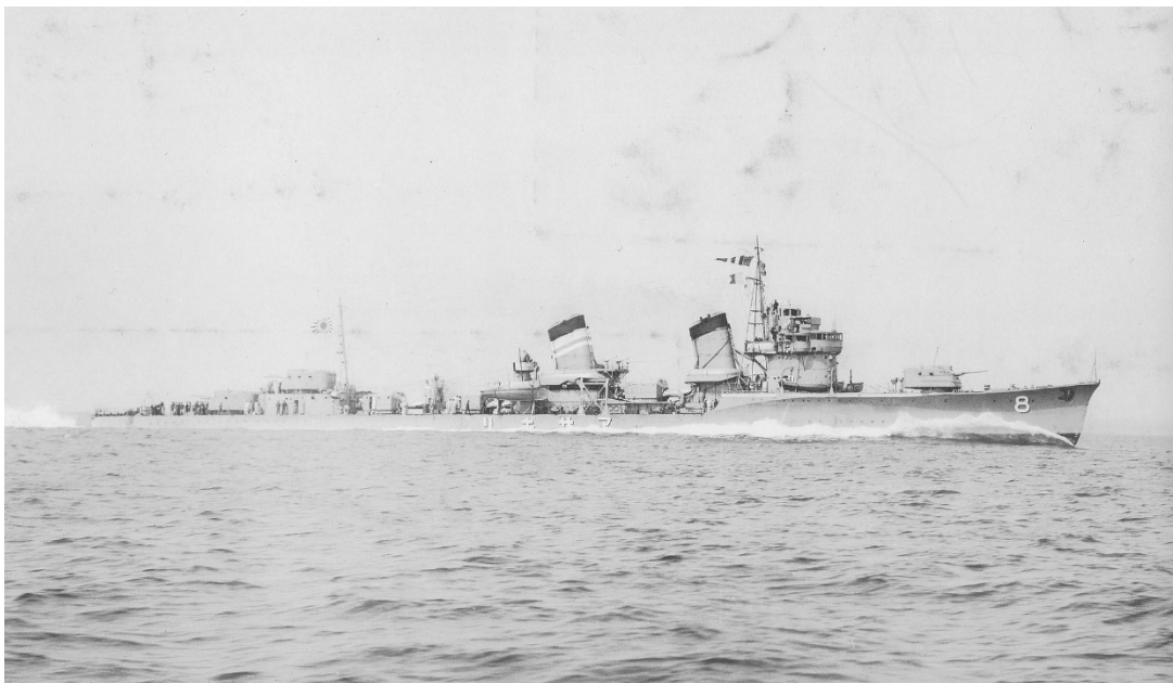
Japanese destroyer 'Asagiri'

The attacking Japanese warships could have been cruisers or destroyers. The destroyers 'Fubuki' and 'Asagiri' were known to have been sinking ships near the location of the 'HMS Yin Ping'. It was an unequal contest in the extreme and the unarmed 'HMS Yin Ping' was easy prey for the sophisticated and very heavily armed Japanese warships, which were world class insofar as speed and armaments and in fact superior to Allied warships in the region at that stage of the War.