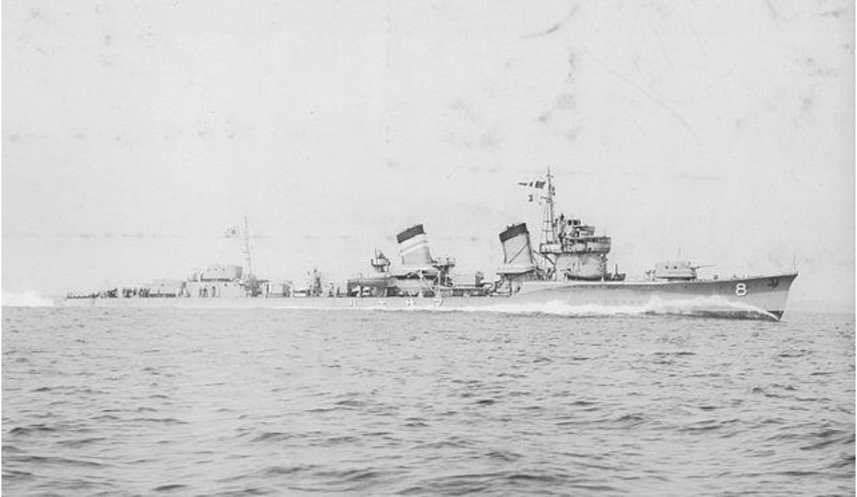
Imperial Japanese navy destroyer: 'Asagiri'

Further research involving the logs and naval records of Japanese destroyers has confirmed to a high degree of accuracy that the Japanese warships were in fact two "Fubuki" class destroyers – these were extremely heavily armed and effective warships. They each carried six 5inch guns and another 32 antiaircraft and mounted machine guns, plus nine torpedoes and were capable of making 38 knots. The specific destroyers were the "Fubuki" and the "Asagiri" which were involved in many of the sinkings of British and Dutch ships in the Indonesian Archipelago and the Banka Straits during this terrible one week period.