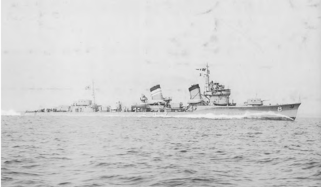
Japanese destroyer 'Asagiri'

Why the 'HMS Yin Ping' was reportedly showing navigation lights we will never know. It was 1930 hrs and so would have been dusk by then in the tropics. The attacking warships would not have been able to pick up the position of the tug by radar because it had not yet been developed for use on ships by the Japanese, but it seems that the various destroyers and cruisers of the Japanese Navy that were strung across the Banka Strait as a net for ships escaping Singapore and were literally sitting, waiting and physically listening because they similarly picked up the passage of other civilian evacuation ships - such as the 'HMS Giang Bee' and the 'SS Tandjong Pinang' – then shone searchlights at them and promptly sank both those ships at very close range, at around the same time in the evening on days before and after the 'HMS Yin Ping' was sunk.