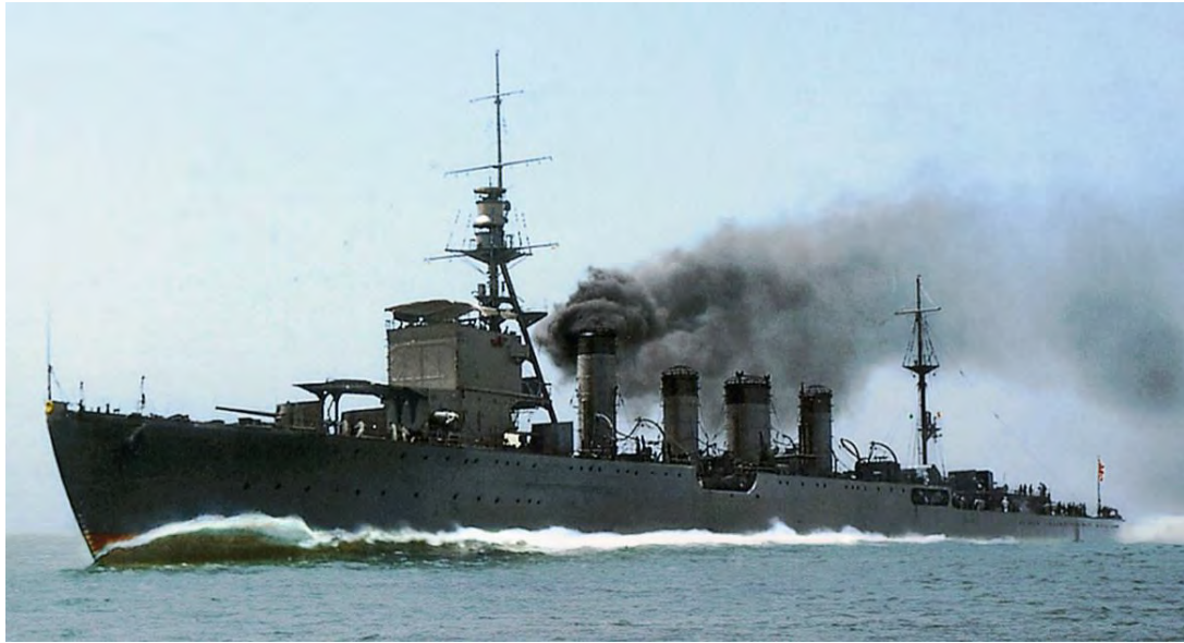
IJN Light Cruiser 'Sendai'