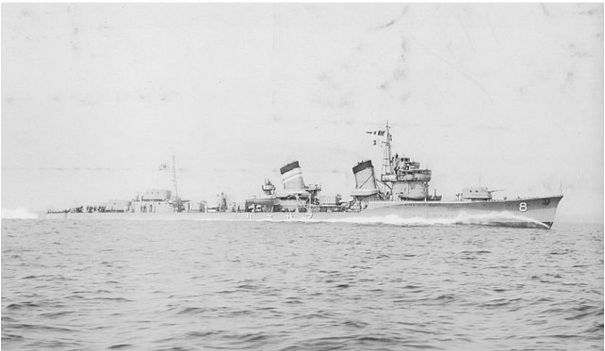
Imperial Japanese navy destroyer: 'Asagiri'

Two Japanese destroyers approached the GB at high speed, one of them signalling in incomprehensible Morse code, and stopped within half a mile of the GB when one of them sent a launch towards the GB. It was within a hundred and fifty yards of the GB when an RAF or Dutch bomber (Anna Silberman and Gordon Reis in their diaries state there were two bombers) from Sumatra suddenly appeared and began circling overhead; the Japanese destroyers opened fire, the bomber (s) flew off, and the Japanese recalled their launch.