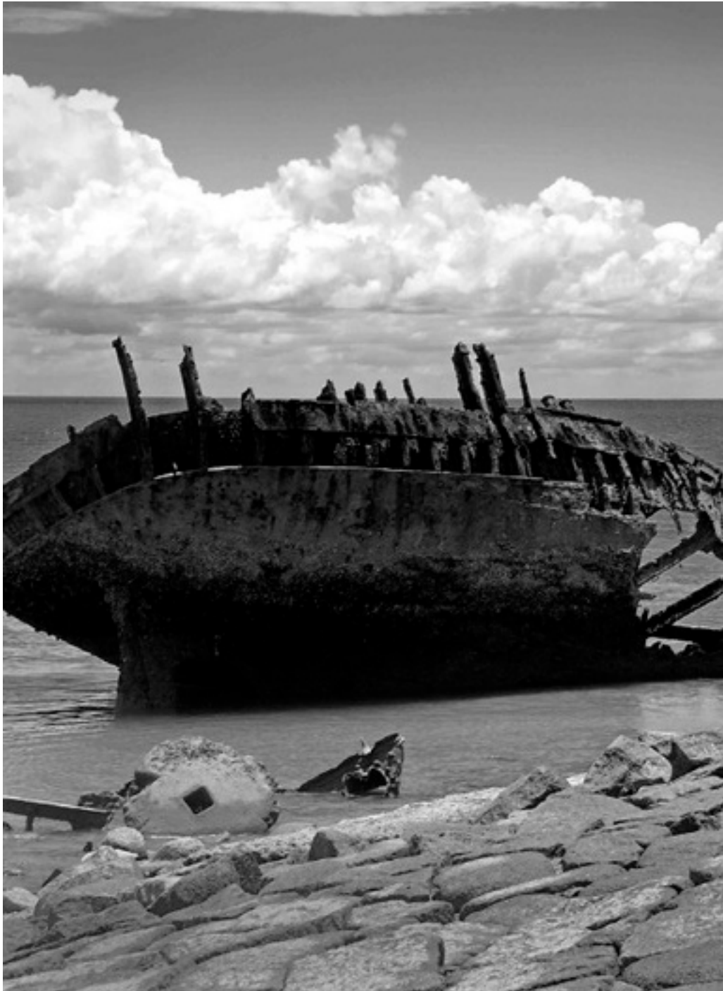
A photo taken at an unknown location on Banka Island – it is possibly the ‘HMS Fuh Wo’ and may be located just north of the stone block construction Tanjong Kalian / Muntok lighthouse. See the next illustration map drawn by Allied Search parties in late 1945 looking for evidence of war crimes committed at Radji Beach.