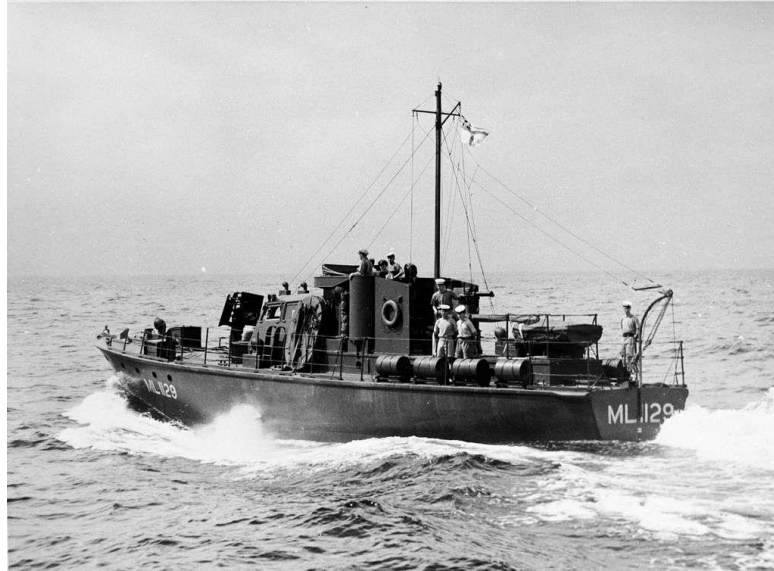
A Harbour Defence Motor Launch of the same design as HDML 1062

HDML 1062 was one of two (the other was HDML 1063) Fairmile Harbour Defence Motor Launches built in Singapore and completed for the Straits Settlement RNVR. Others, with batch numbers up to 1220, had been planned or construction started, but wartime events and the invasion of Singapore meant they were not completed - and some never started. In fact, post War in 1946 the 'Straits Times' newspaper had an advertisement for the sale of HDML1086 "... in bad condition... " at Thornycroft, Tanjong Rhu. HDML 1086 must have languished, incomplete, in Singapore during Japanese occupation.