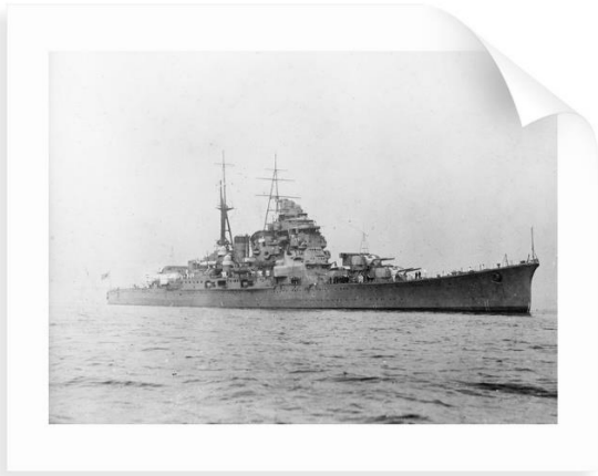
IJN Cruiser 'Chokai'

The modest sized HDML 1062, really just a large launch, would have been totally shattered by the first hits from shells from a large warship like a Cruiser – if Lt Stein was correct in his identification of the specific type of warship. If a Japanese Cruiser it would have been either the flagship of the Japanese invasion fleet, the 'Chokai' and its eight-inch shells, or the 'Kashii' and its five-inch shells: -