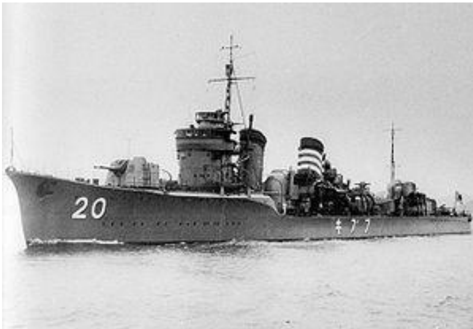
Imperial Japanese Navy Destroyer 'Fubuki'