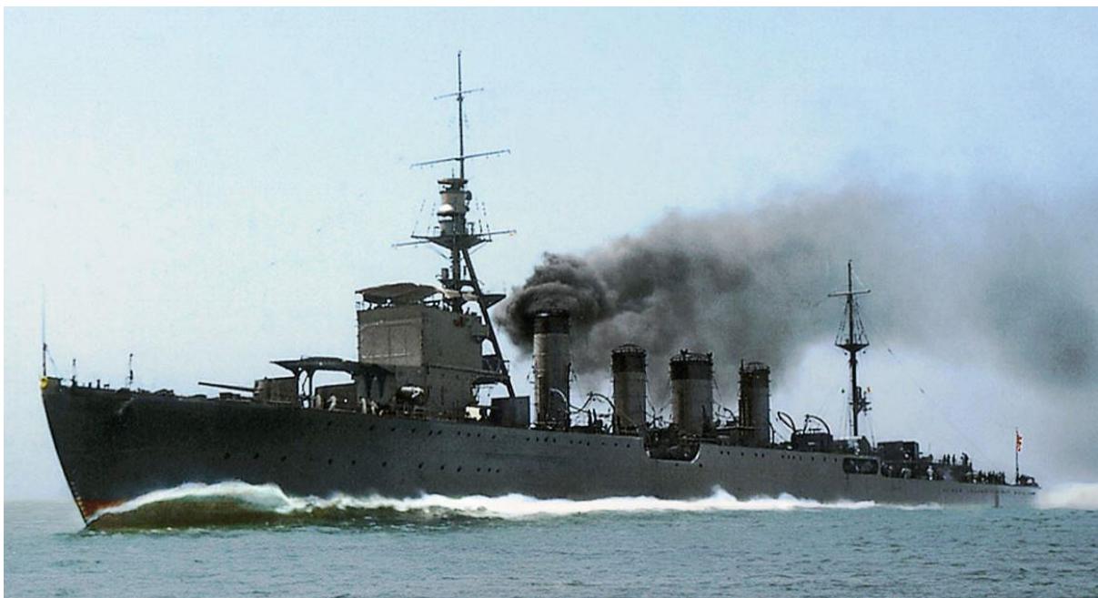
IJN Light Cruiser 'Sendai'