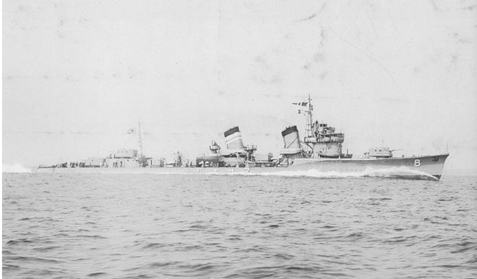
Imperial Japanese Navy Destroyer "Asagiri"

The log of the IJN destroyer 'Asagiri' also shows that, from the 13 th to the 15 th of February 1942 it assisted the destroyer 'Fubuki' in attacking Allied shipping fleeing from Singapore and they sank four vessels with great loss of civilian life. Research has revealed this included the auxiliary merchant ship 'HMS. Giang Bee' on the evening of 13th February and the auxiliary Chinese River steamer 'HMS Li Wo' near Banka island on 14 th February.