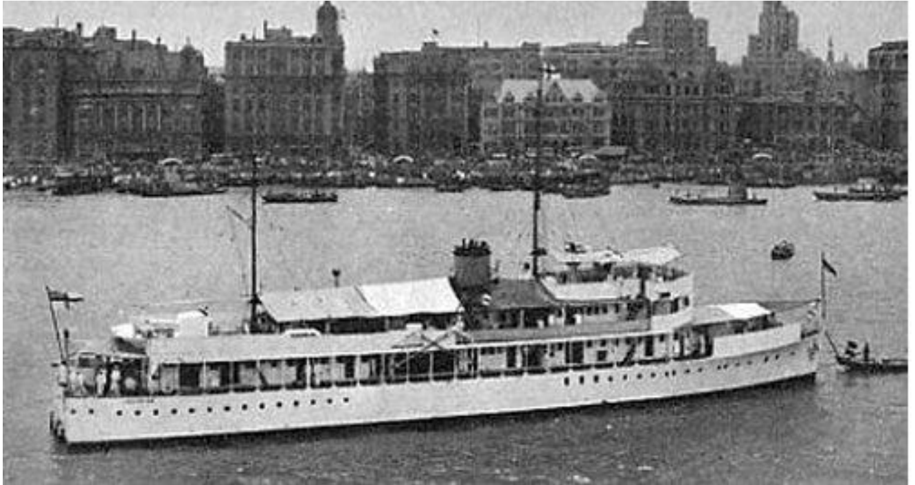
'HMS Scorpion' – appears to be anchored in Hong Kong or Shanghai.

The invasion of Malaya and Singapore, from the time of the first landings in Northern Malaya on 8 December 1941, was swift and brutal. Within eight weeks the Japanese had taken Malaya and landed on the island of Singapore which had become intensely overcrowded by tens of thousands of fleeing civilians of all races from Malaya plus almost 100,000 servicemen.