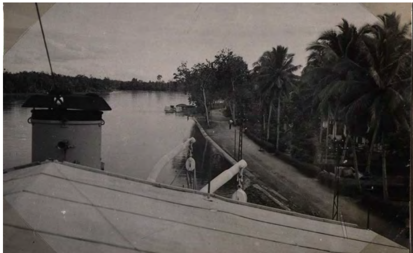
Rengat on the Indragiri River (old photo)

All the survivors - except for Signelman Peckham and possibly Sgt Bennett who appear to have been swept south by sea currents to near the Jambi River - would have made their way slowly across Sumatra, firstly upstream stopping at the small towns of Tembilahan and Rengat on the Indragiri River, then to Sawah Lunto (an old Dutch mining town) across the mountains on the west coast and by train down to the plains on the west coast and Padang.