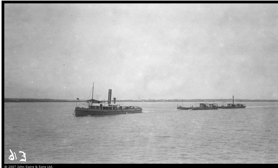
Photo of what is very probably 'Changteh' towing barges on the Yangtze.

By 1941 the constant and escalating fighting between the Chinese armies and Japanese invaders, together with the increasing prospect of hostilities between Britain and Japan, had become such a threat that the Royal Navy requisitioned many of the passenger vessels and tugs working on the Yangtze River and relocated them to be fitted out with appropriate equipment and used as 'Auxiliary Minesweepers' in Singapore. Many RNR/RNVR/MRNVR officers were assigned to these vessels.