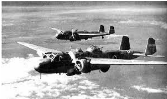
Mitsubishi G3M bombers

Typically, Japanese bombers flew in formations of nine planes at a time in 'V' formation. Many reports of attacks at sea suggest the precision of the aim of Japanese bombers was not particularly good in the case of small, fast naval vessels but amongst the evacuation vessels their targets were often at anchor or relatively slow merchant or auxiliary vessels such as tugs or other work craft – nevertheless, even 'near misses' (as Puckridge comments) flung enough shrapnel to create damage to men and wooden decks or superstructures.