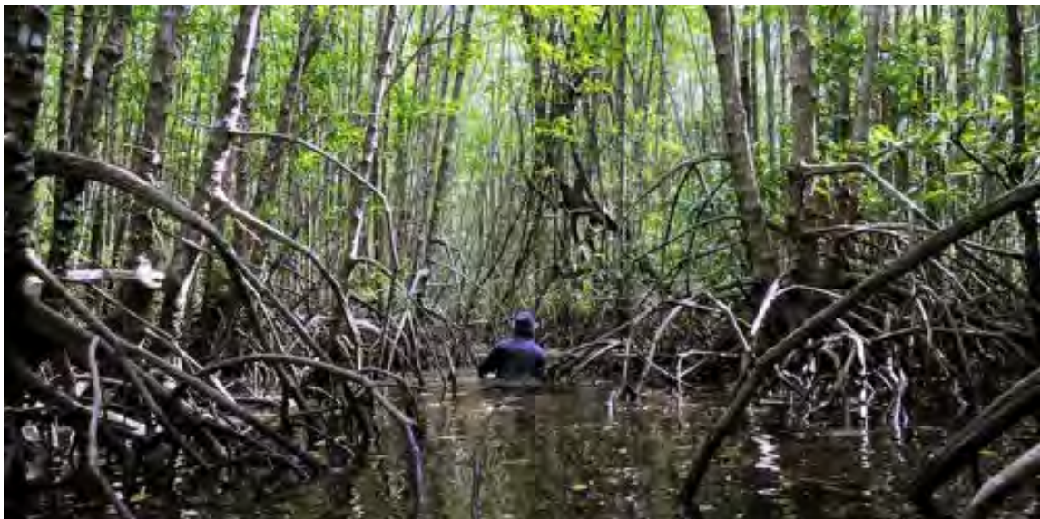
Reality of Mangrove swamps