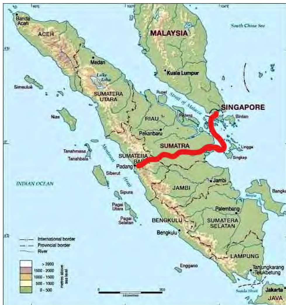
Official escape route from Singapore February 1942

The only reference to where survivors were picked from the sea is in one of Robert Puckridge's statements ( see below) which indicates that the ship might have been bombed well north of the entrance to the Indragiri River, somewhere west of Pulau Lingga - which because of that location in turn suggests that the Japanese bombers which attacked 'Changteh' were the same flights of bombers which attacked the 'SS Kuala' ( with 700 women and children aboard) and the ' Tien Kwang' ( packed with RAF and civilian men) when they were both anchored , desperately trying to hide', at Pom Pong Island in the Lingga Archipelago of islands earlier that same morning of 14 February. These bombers must have killed hundreds of people at sea that day.