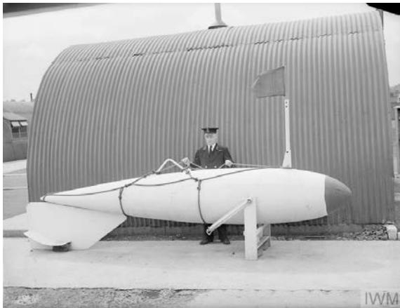
An Oropesa Float (used by Minesweepers to clear mines during WW2) on which Signalman Colin Findlay, RNZNVR, survived nine hours floating at sea before being picked up by 'HMS Malacca'.