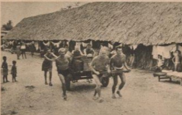
Providing food was task of nearby male prisoners—only alleviation of women's fate. Here a working party is seen bringing mid-day ration into their camp. It was hard work.

they tried to maintain a semblance of civilized life. This is where they cooked and washed and slept for three and a half years. When liberation came their spirit was unbroken