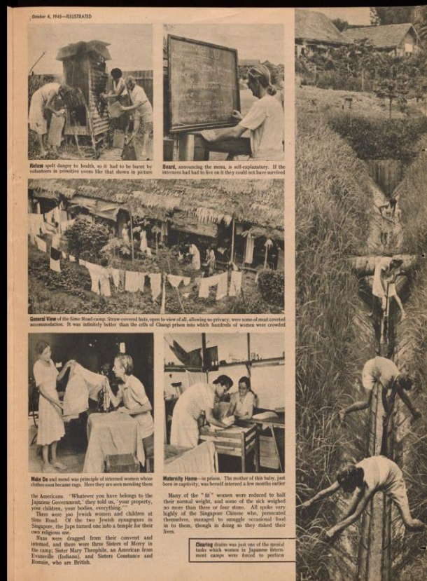
Women's Area, Sime Road Internment Camp