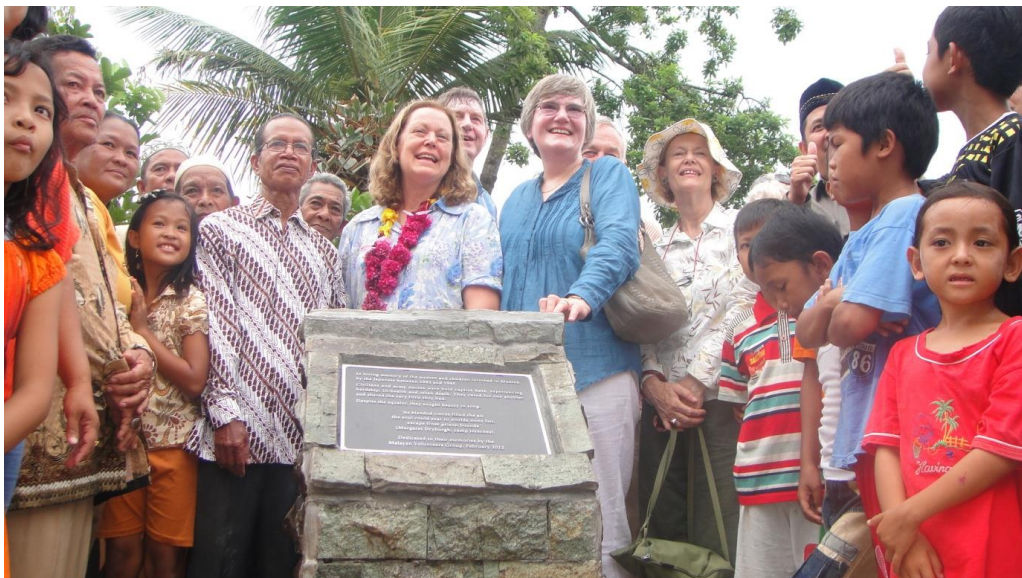
(The plaque to the women and children in the village where the camp was situated.)

From here we proceeded to the village which was the site of the former women's and children's camp. 20 families now live here and they came to greet us at the tiled plinth which was to hold the plaque. The Regent spoke to them, saying that all our families had been in Muntok at the same time and thus we are all one family now. He asked the people to take good care of the plaque for us.