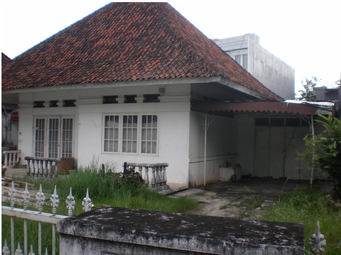
(example of an older Dutch house with garage, in Bukit Besar, near the area of the women's camp, Palembang)

While in Palembang, we were met by Putu, an employee of the Timah tin company in Muntok, his wife Komang and little daughter. We visited the site of the women's internment camp at Talang Semoet, and could match the streets shown on the old East Indies Camp Archives map with a modern-day street map. Many of the older-style Dutch houses which formed the first Women's camp are still in place.