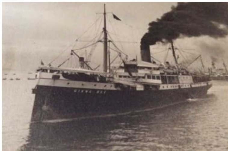
Royal Navy Auxiliary vessel ‘HMS Giang Bee’

Two Japanese destroyers approached the GB at high speed, one of them signalling in incomprehensible Morse code, and stopped within half a mile of the GB when one of them sent a launch towards the GB. It was within a hundred and fifty yards of the GB when an RAF or Dutch bomber (Anna Silberman and Gordon Reis in their diaries state there were two bombers) from Sumatra suddenly appeared and began circling overhead; the Japanese destroyers opened fire, the bomber (s) flew off, and the Japanese recalled their launch.